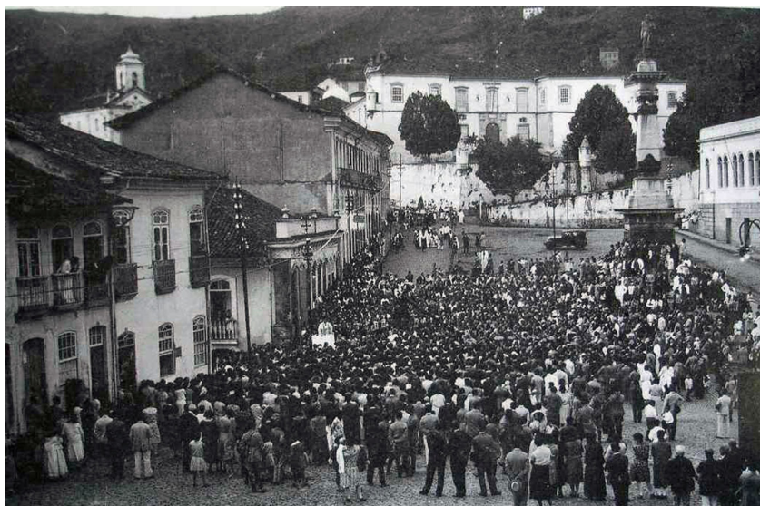
Figure 12. Steps Procession. Date: 1931.

surrounding the Tiradentes Square lived in its daily lives, from the 1990s to March 2014, with the fact to present as a large parking (Figure 13). Because of traffic problems and the annoyance of local residents with the Square use in March 2014 it was banned parking in the Tiradentes Square .