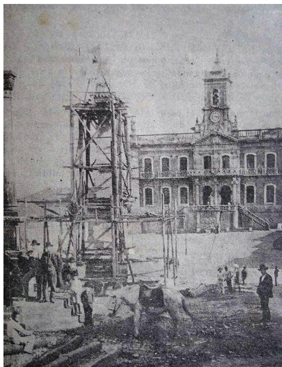
Figure 6. Monument to Tiradentes under construction. Date: July 1992