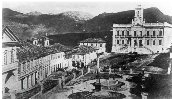
Figure 5. Independence Square Garden with the Paço Municipal . Date: 1881. Figura 5. Jardim da Praça da Independência com o Paço Municipal . Data: 1881.

Note the garden surrounding was all protected by railings (Figure 4), and also the presence of a fountain and Saldanha Marinho column. The fountains were common in gardens from that time, and despite not having full details, this fountain is very similar to what is today in the premises of the Pharmacy College of UFOP in Ouro Preto , but nothing can be said about it. What has been observed, and it is common in the history of many monuments in Brazil, is that the records have been lost with the time, resulting from the small historical and cultural value that permeates the country.