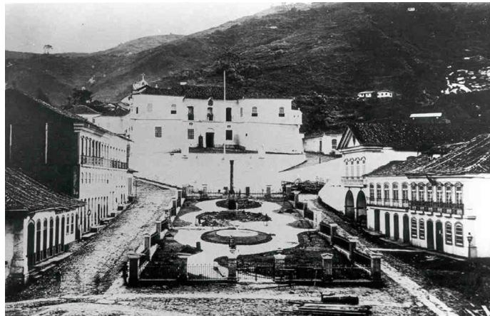
Figure 4. Independence Square Garden with the Government Palace. Date: 1881. Figura 4. Jardim da Praça da Independência com o Palácio do Governo. Data: 188.

However, it found no record of the garden design nor the landscape design who designed it.