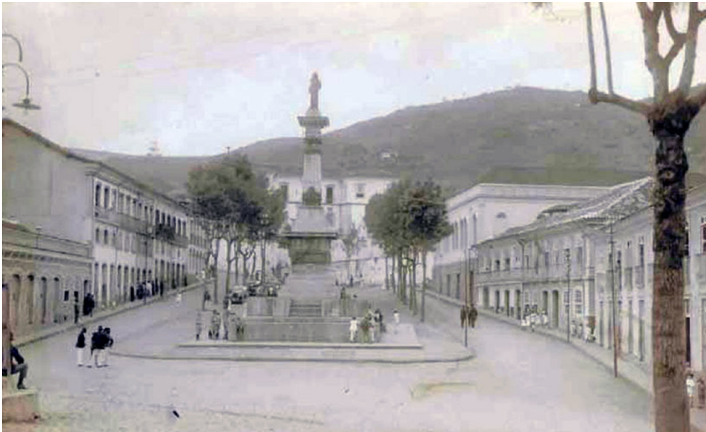
Figure 10. Tiradentes Square with palms and trees. Unknown author. Date: 1922. Source: Collection of the Public Archives of Minas Gerais

trees in Ouro Preto , but when analyzing the Tiradentes Square photograph of 1931 (Figure 11), it is clear that the trees which before delimited the rectangle that surrounded the Square, are no longer present, leaving only openings devoid floors and earth mounds where once were their trunks. Note also that trees going up the ramp to the School of Minas were not cut at that time. The fact that the image show earth mounds where there were trees indicates that these were cut short time before the photograph date, in 1931.