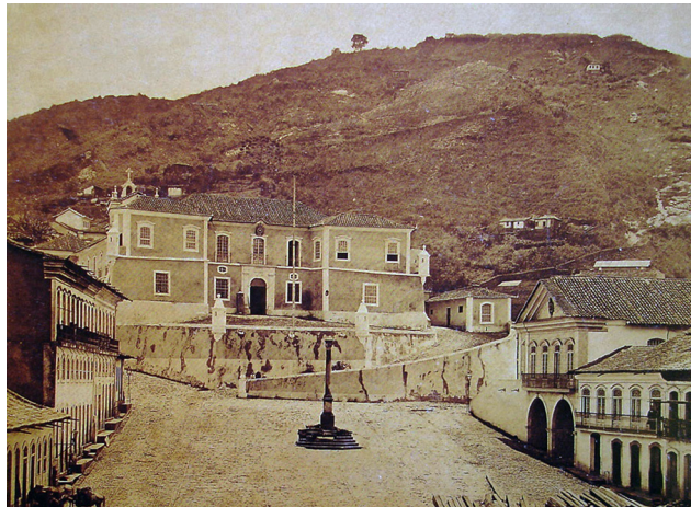
Figure 1. Ouro Preto's Inconfidência Square. Unknown author. Date: 1870. Source: Collection of Inconfidência Museum.

In 1867 occurred in the square, today known as Tiradentes Square , the laying of the foundation stone of the monument designed in the martyrs' honor of the Inconfidência of Minas Gerais .