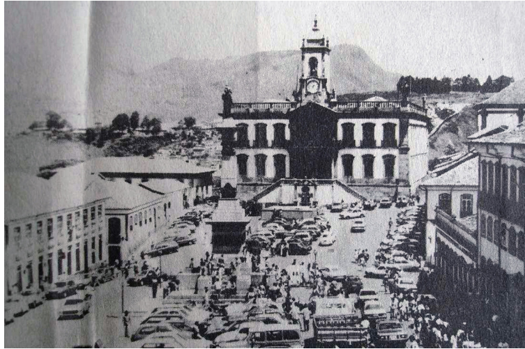
Figure 13. Tiradentes Square in the 1990s. Date: July 4, 1995