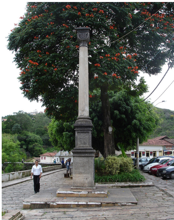
Figure 3. Coluna Saldanha Marinho. Date: 2007

the presence of Francelino Pereira dos Santos - Minas Gerais Governor - and João Batista de Oliveira Figueiredo - the President.