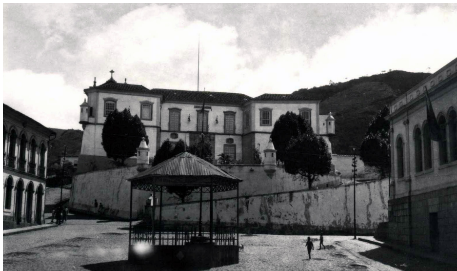
Figure 11. Tiradentes Square with freshly cut trees. Probable date: 1931.