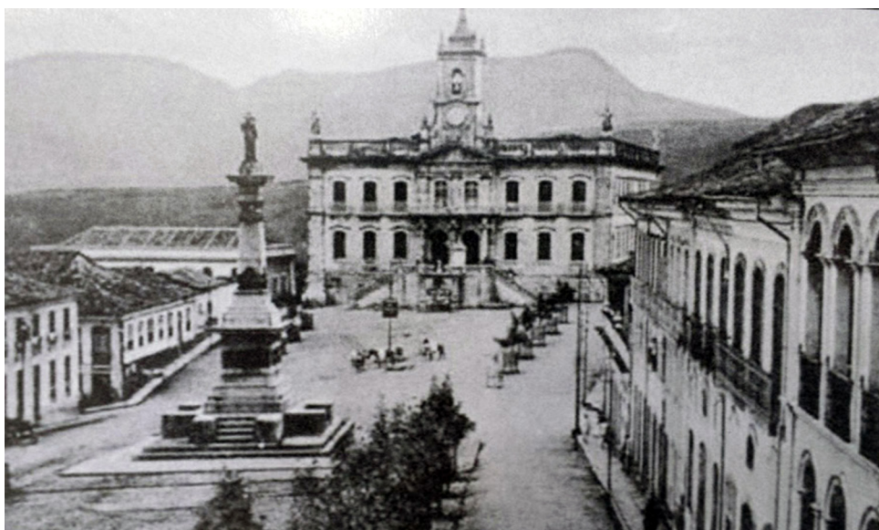
Figure 9. Tiradentes Square with trees in front of the Museum. Author: Unknown. Source: Book Tricentenary of Ouro Preto . Date: 1911

Figura 8. Arborização da Praça Tiradentes. Fotografia: Luís Fontana. Data provável da fotografia: 1920. Fonte: Acervo do IFAC