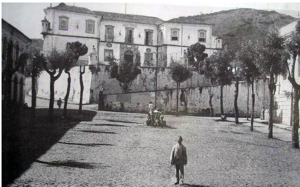
Figure 8. Afforestation of Tiradentes Square. Photographer: Luís Fontana. Probable date of the photography: 1920. Source: Collection of the IFAC

The image of Figure 10, decade 1922, photograph taken at that time in the tour of Sir President of the Republic - Dr. Epitácio Pessoa – to the Minas Gerais State, in the company of Lords - Dr. Arthur Bernardes and Raul Soares – note with clarity this vegetable alignment present in Figure 9 it is also trees.